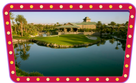
Bali Hai GOLF CLUB