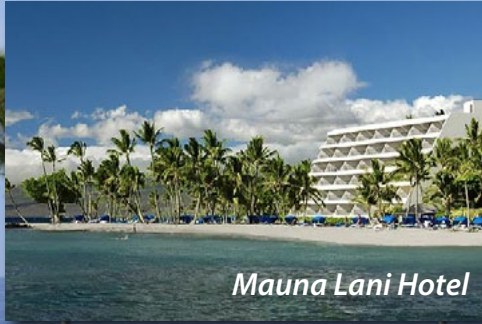
Mauna Lani Hotel

Entry Fee: $2,875 per person/double occupancy • Non-golfer: $1,695