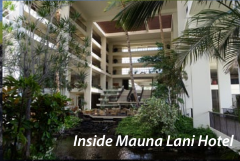
Inside Mauna Lani Hotel